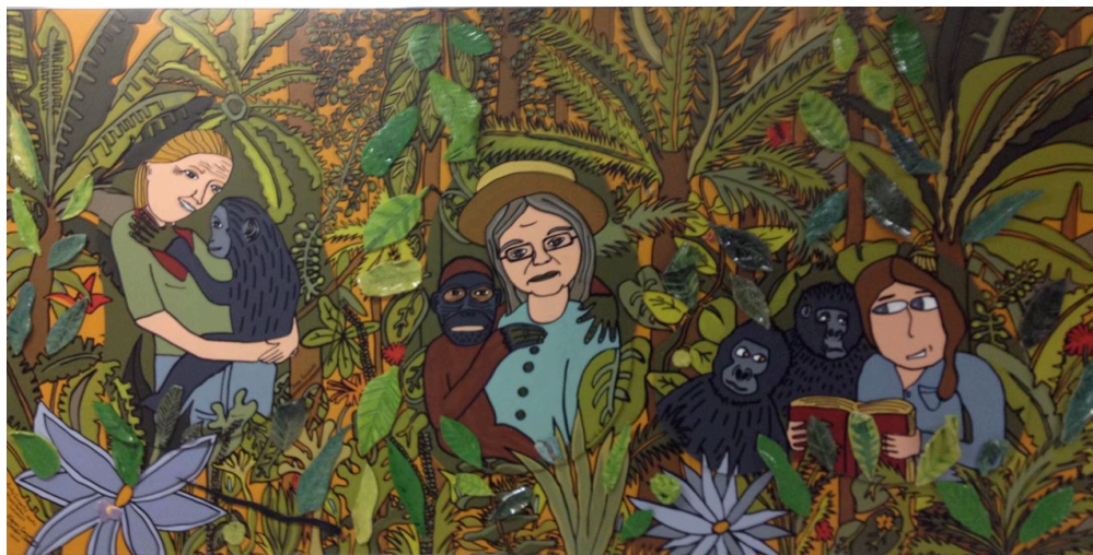
Pioneer Female Primate Researchers: