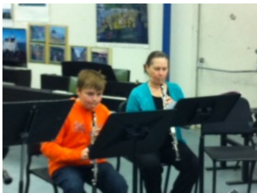
Double Reed Day!

“One ought, every day at least, to hear a little song, read a good poem, see a fine picture, and, if it were possible, to speak a few reasonable words.”