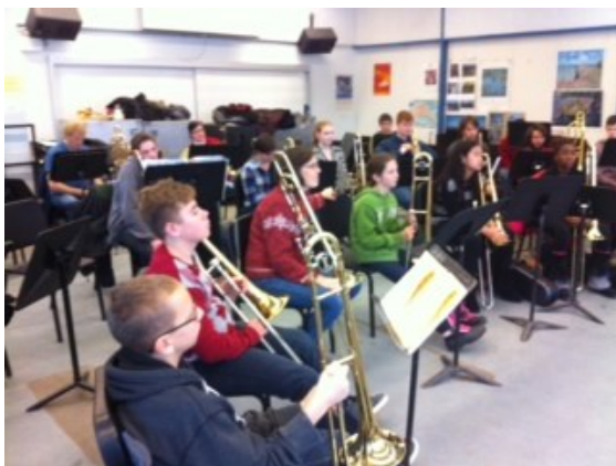
Low Brass Christmas!