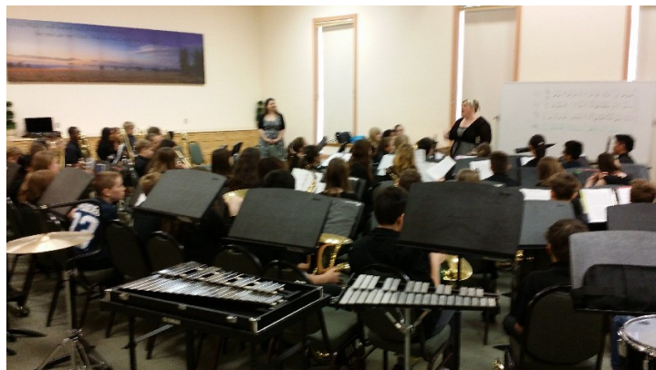
Level One Festival

If students are auditioning to play an instrument different than the one that they play in concert band, they may choose to audition either on their concert band instrument or on the new jazz instrument. Students may be asked to play their secondary instrument if possible.