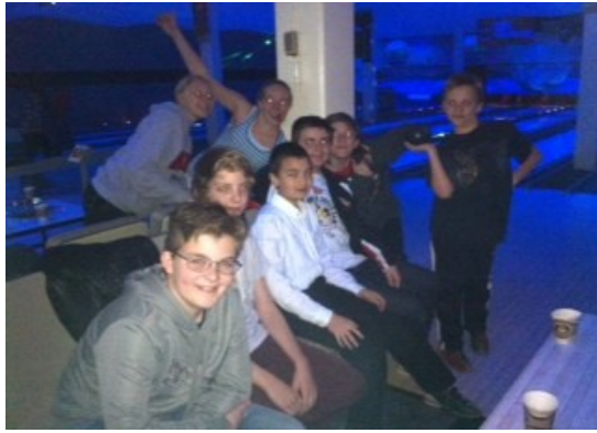
Level One Festival